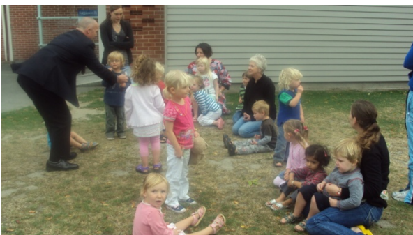
Eating our Jelly Beans