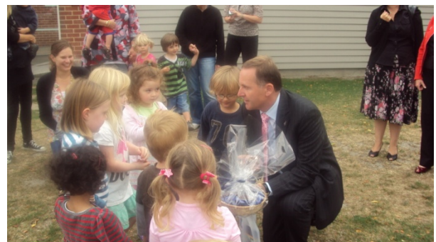
Meeting the Prime Minister