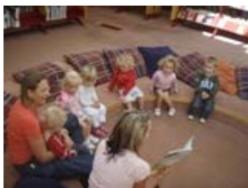
2- year olds enjoying story time in the school library

A balance of child-initiated play and small group times provide children with varied experiences. Our location in the grounds of Rangi Ruru Girls' School provides children with opportunities to utilise the wider environment, including the school library, the gymnasium, playing fields and other facilities.