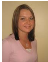
Becks Ching Dip T (ECE) NZNNC