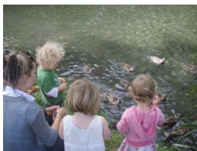
Feeding the ducks at the local reserve